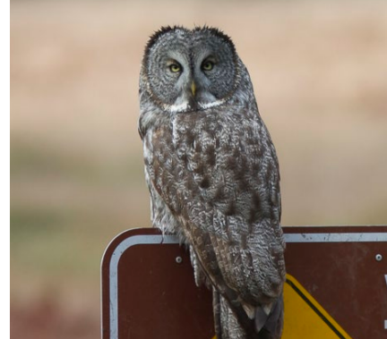
Great grey owl

Owling involves standing very still in the darkness and listening intently. Dress warmly and bring a flashlight.