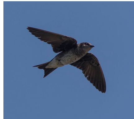
Purple Martin by Ron LeValley

Meet at the bridge on Philo-Greenwood Road. We will bird from the bridge and nearby areas, then go into the park and walk a loop trail. Swallows and Purple Martins, Black-headed Grosbeaks, and Black-throated Gray Warblers are regularly seen; sometimes Western Tanager, Hermit Warbler, and Green Heron. Barred Owls roost in the campground and are sometimes heard calling even in daytime. Please bring water and a picnic lunch.