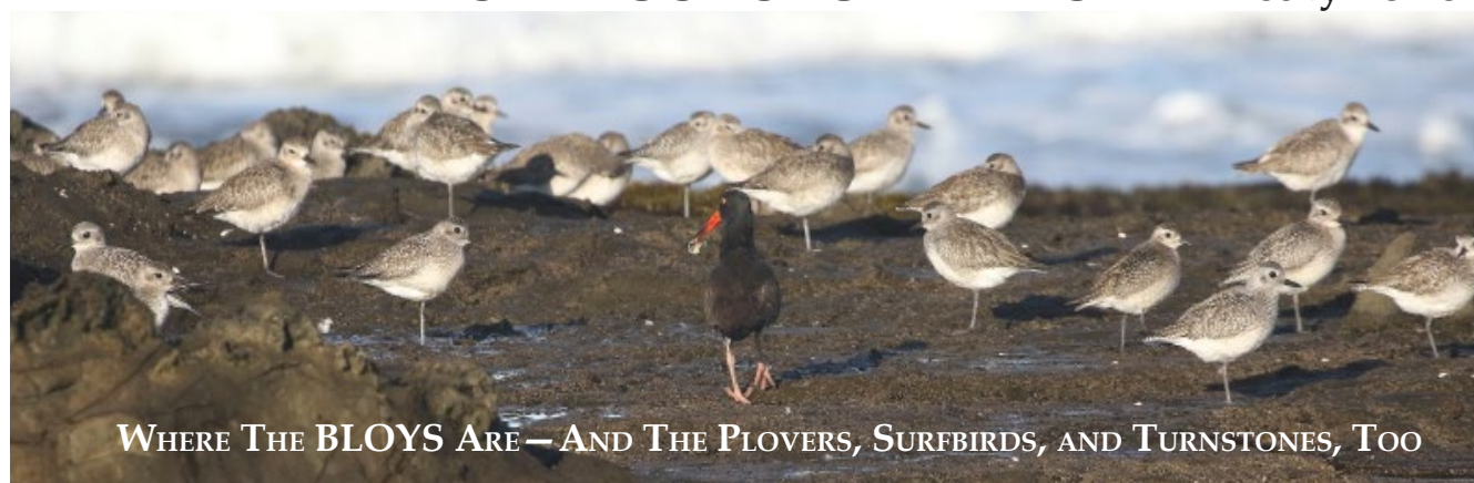
WHERE THE BLOYS ARE — AND THE PLOVERS, SURFBIRDS, AND TURNSTONES, TOO

Black Oystercatcher (center) with Black-bellied Plovers on Ward Avenue beach loafing rock.