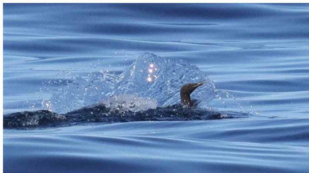
Common Murre (in summer plumage) enveloped in water as it landed on the sea