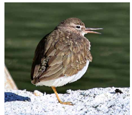
Spotted Sandpiper in winter plumage, at the dock. Read about the impromptu whale and bird cruise on page 3.