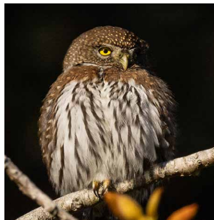
Northern Pygmy-Owl

This year's owl safari will be held on Saturday, March 16. Meet in Elk at the parking lot across from the store at 6:45 PM. We will carpool and head up the ridge, returning around 9.30 pm. The variety of habitats along Philo-Greenwood Road hold several species of owls, and in March they can be quite vocal. Carpooling is necessary for this trip because the turnouts on the road are small and only a few cars will fit. Heavy rain cancels.