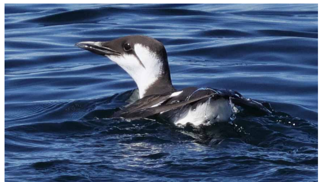
Common Murre in winter plumage by Tim Bray