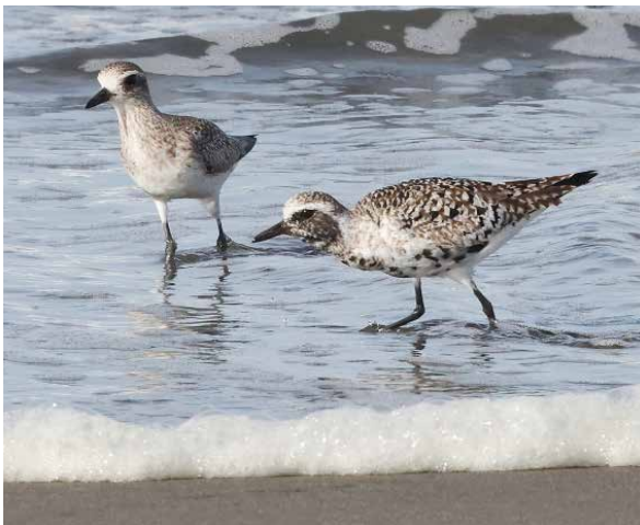
Black-bellied Plover