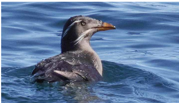
Rhinoceros Auklet in breeding plumage

This month we have a four-hour trip scheduled for Friday March 8 - see the notice for the Feathers & Flukes trip on page 8 of this Newsletter.