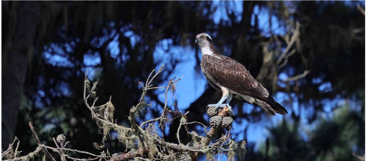
Osprey in pine tree above Noyo River

A rare window of calm weather inspired several birders to join a whale-watching cruise on the Kraken, Saturday February 24. The ocean was calm and blue, the air was warm and still, and we enjoyed a nice trip out. Whales were difficult to find and birds were scattered, but we did see a lot of Common Murres and a fair number of Rhinoceros Auklets. Interestingly the Auklets were in breeding plumage, sporting impressive plumes and the “horn” for which they were named, while the Murres were in both winter and summer plumages. We also saw two Pigeon Guillemots, unusual this early in the year, both in summer plumage. Before we even got out of the harbor we saw an Osprey perched in a pine tree, also unusual for this time of year.